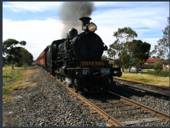
D3 658 at Ardeer