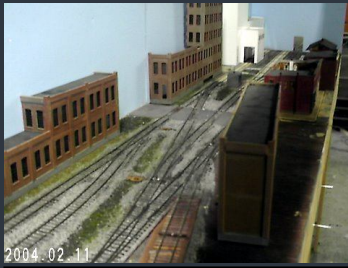
MMRC's new layout – Frisco Union Belt Lines!