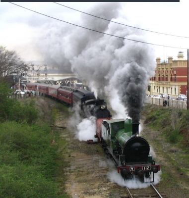
Y112 at Ballarat