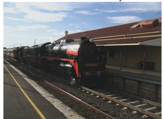
R761 passing Melton Station

From there, the MMRC has grown quickly, and we're now meeting every second Saturday at Noon. We're also very fortunate to have the use of the facilities of Ruby's Pizza Restaurant, in Melton South. Members meet here in comfortable surrounds, within earshot of the Melton railway line and Melton station. Come down and visit us and say hello!