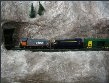
Y Classes on the Sunshine MRC layout