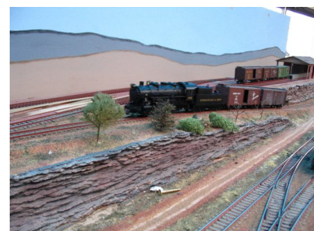
0-8-0 switcher heads to the upper yard