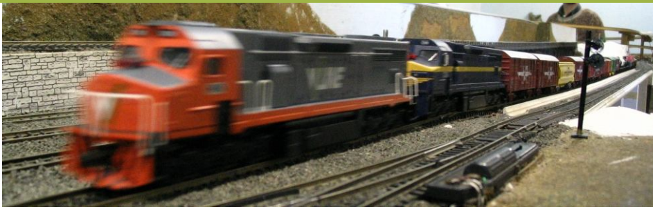
Above: C Class power double heading a "Super Jet" on the SMRC layout