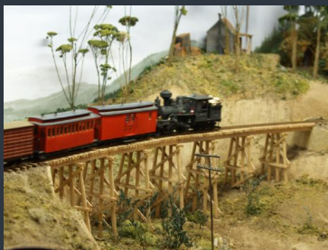
Climax locomotive hauling narrow gauge stock