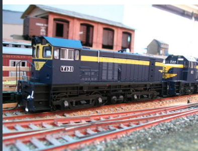
Y and H posing for a photo opportunity

Later on, the layout was changed over to enable DC running with Adam’s Australian outline, DC locomotives. The session then ran with 2 Y classes (Y131 VR and Y137 V/Line), T357 (VR), H2 (VR)