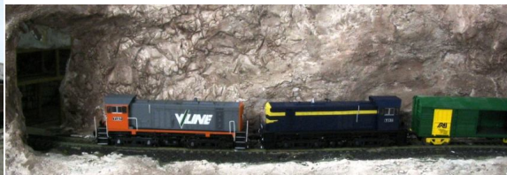
Above Left: C classes posing with the Hogwarts loco Above Right: Double heading Y Classes passing through the mountain range Below Left: The Hogwarts Express Below Right: A Double headed "Super Jet" rockets up the incline to the main line