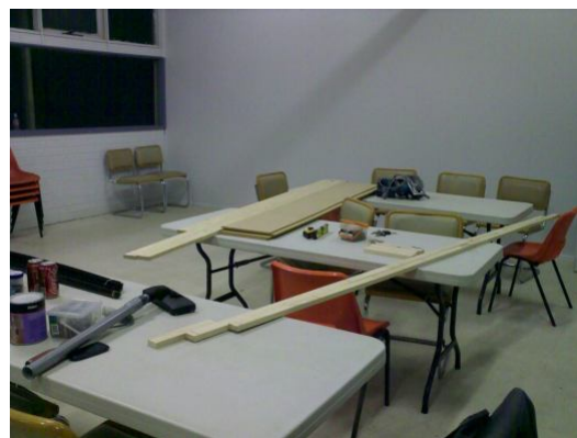
Construction begins on the Test Track layout!