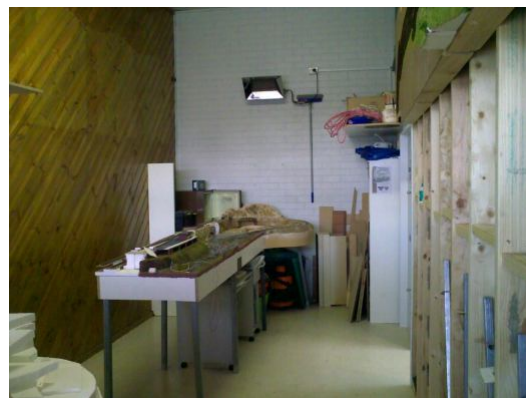
A very tidy layout room!