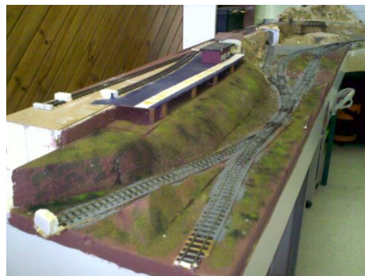
The On30 Layout taking shape