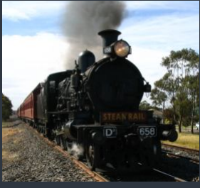
D3 658 at Ardeer