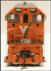
MMRC's HO Scale motive power!

Austrains Locomotive V/Line liveried Y146